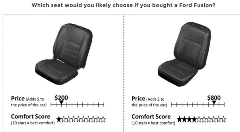
Fig. 4. Example of choice-based conjoint survey question presented to customers. Note that each survey question consists of a binary preference choice between two seat profiles represented by 3 attributes—seat form, price, and comfort rating.

A total of 20 questions—16 questions for training utility models and 4 questions for validation of utility models—were asked of each customer. The 16 survey questions for constructing each customer’s individual utility model were created using the Latin hypercube sampling technique (McKay et al., 1979) in MATLAB (Mathworks, 2016), while the 4 survey questions for validation were generated randomly. We used the Django web application package for building the online web-based survey.