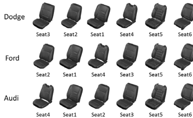
Fig. 5. Rank of seat form preference according to brand segmentation (highest rank left)

Observation 2: Luxury customers care more about seat form and comfort.