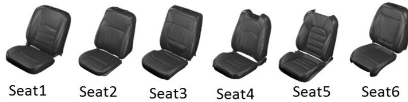
Fig. 2. 3D scanned automobile seat images

decomposition. Each seat form used in the survey was presented using the same view orientation and color shown in Fig. 2.